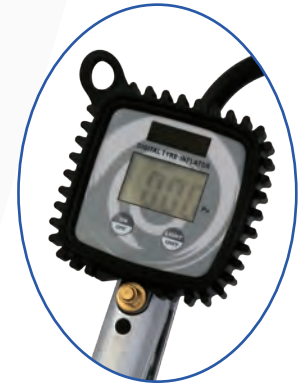
Comfortable and clear tyre inflator